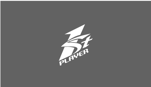
CPU LIQUID COOLER CC 240